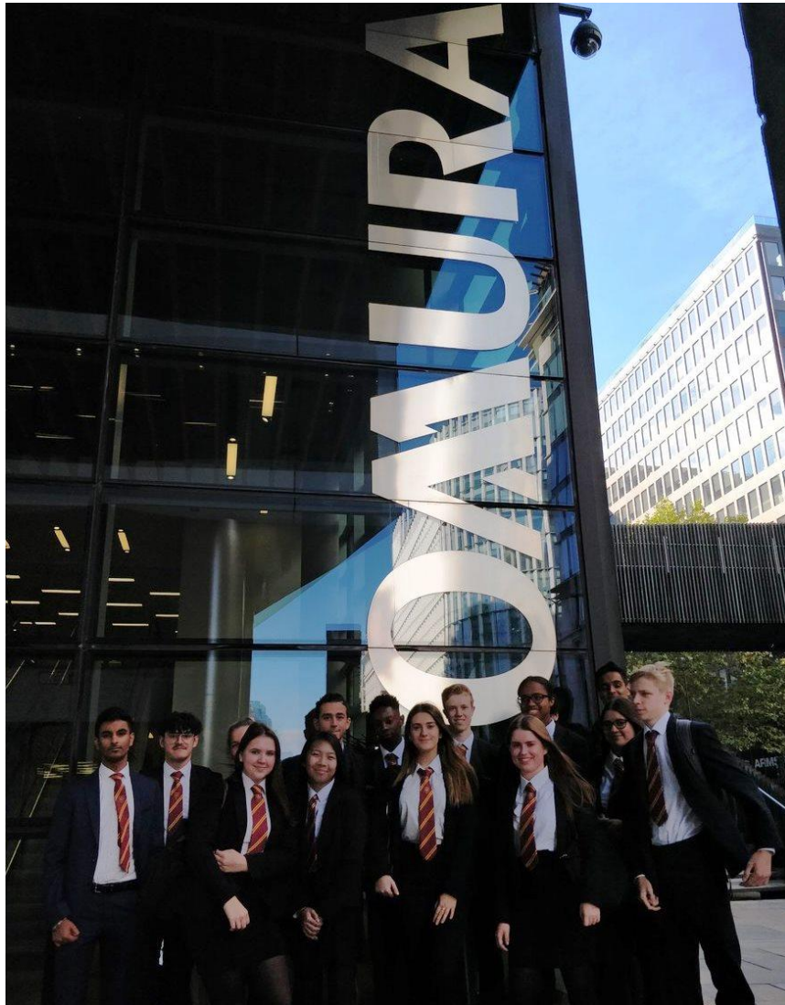
Y12 Economics attend a networking event With the investment bank Nomura