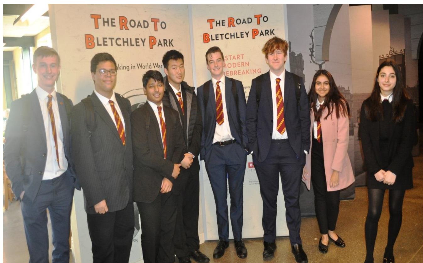
Y12 Computer Science students during their visit to Bletchley Park.