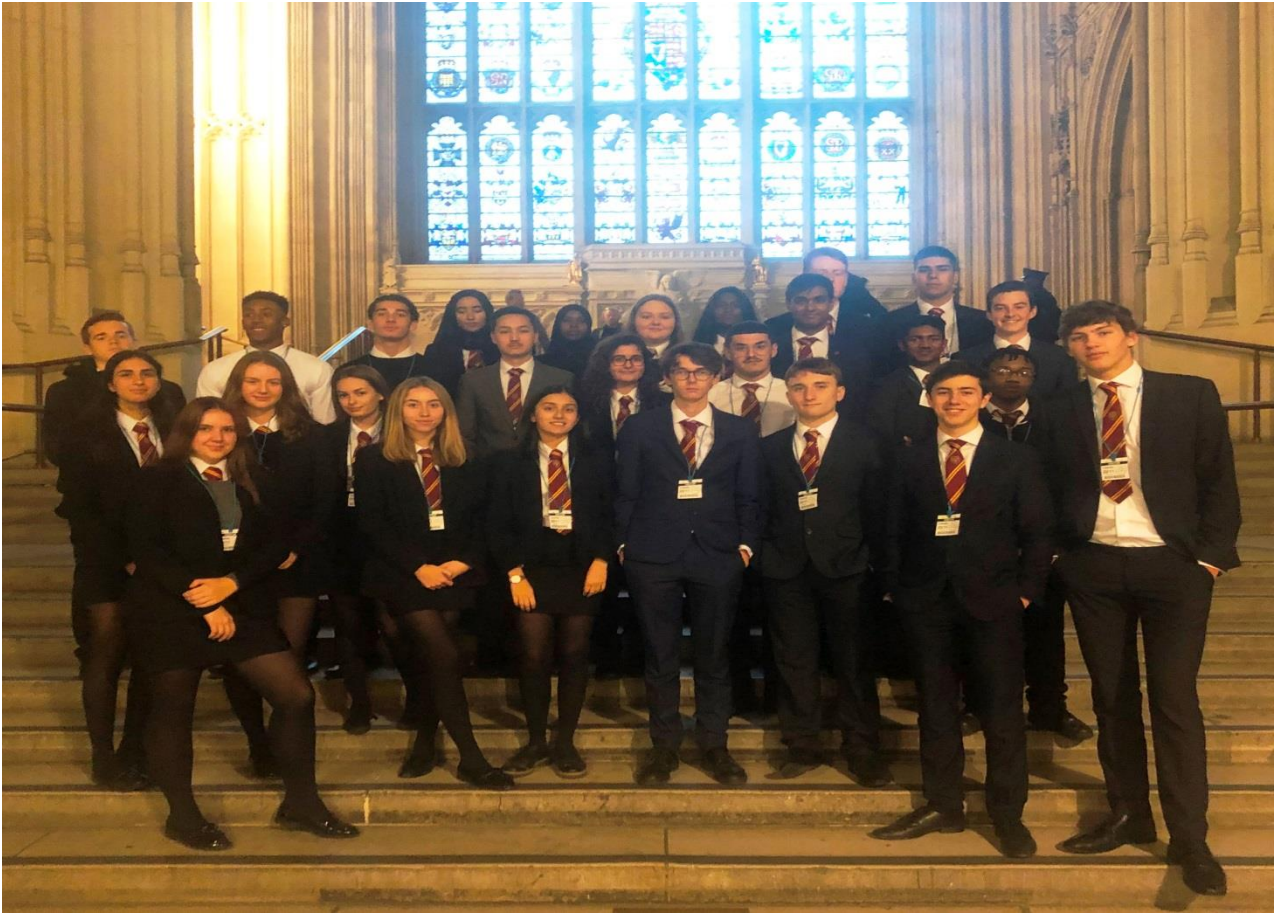
Y12 History & Politics students visiting the Houses of Parliament.