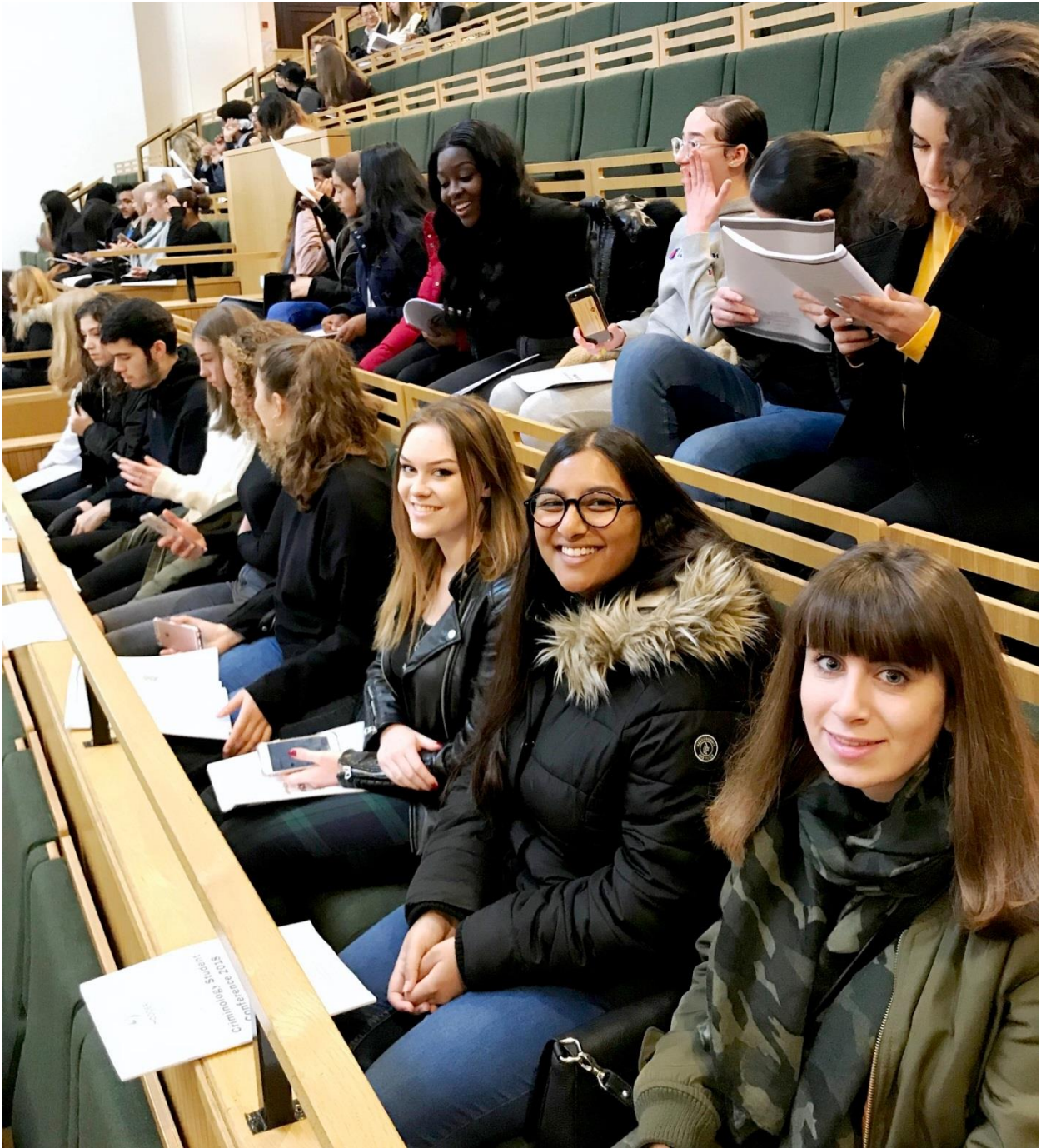
Year 13 Sociology students enjoying themselves at a Criminology conference.