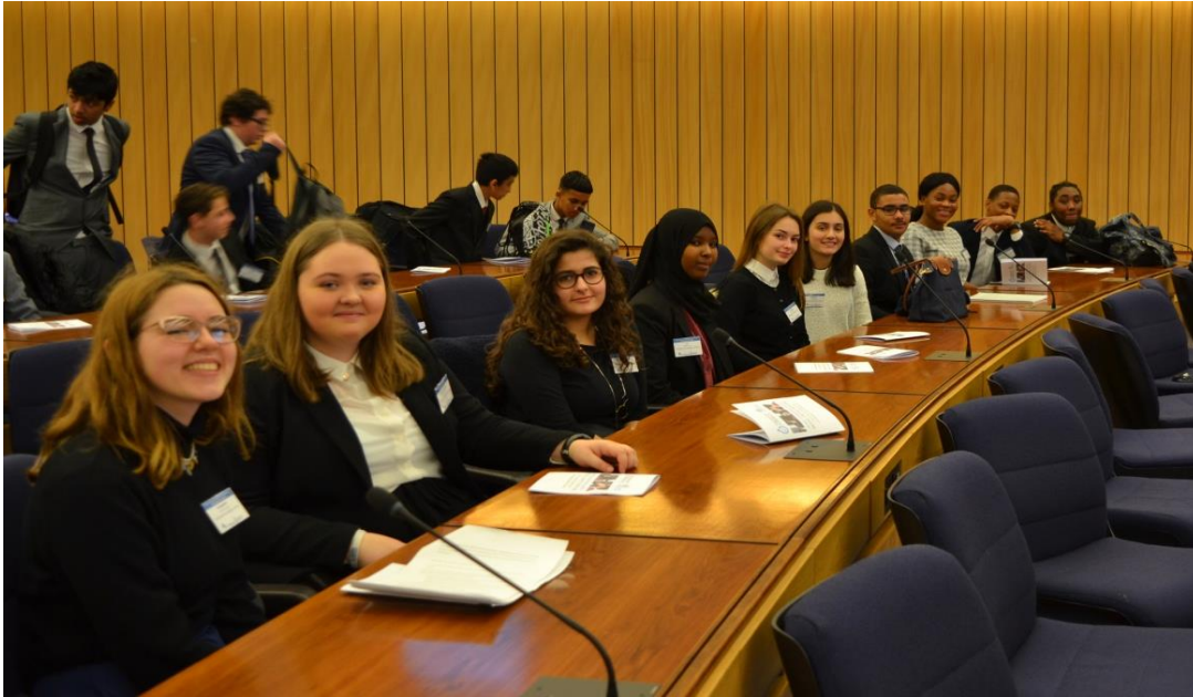
Students attending the Global Classroom's Model United Nations Conference

A happy new year to all CFS students! Welcome back!